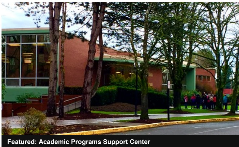
Featured: Academic Programs Support Center