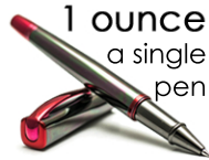
1 ounce a single pen