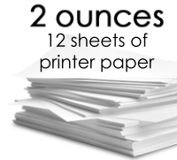
2 ounces 12 sheets of printer paper