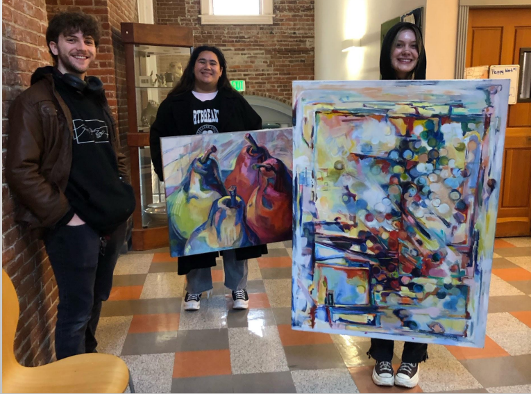
Demand for Art & Design