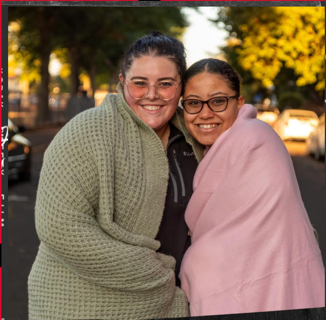
New Student Sunrise