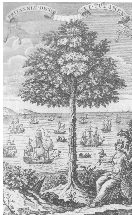
Figure 1: The banner translated to read, "Britain's Glory and Protection," the central character to this eighteenth century illustration is a mature oak tree, standing before a backdrop of naval ships and other vessels, the hulls of which required many such oaks to construct. At the tree's base sits Britannia , a symbol of Great Britain, holding an oak seedling. The illustration was perhaps a propaganda piece promoting the re-planting of oaks to assure the perpetuation of British strength as a maritime nation. From Perlin, A Forest Journey , 30.

While such oaks were produced domestically for the most part, the necessary importation of other naval stores like pitch, tar, hemp, and masts dramatically shaped England's foreign policy. By the eighteenth century, it was common practice for the Crown to send diplomats to the timber-rich Baltic countries for the purpose of securing such stores. Insuring the availability of naval stores for England at all costs while