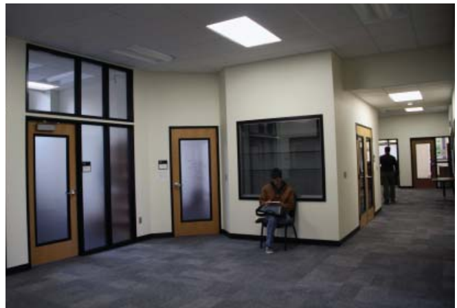
The new Edward B. Wright Center for Computing Sciences