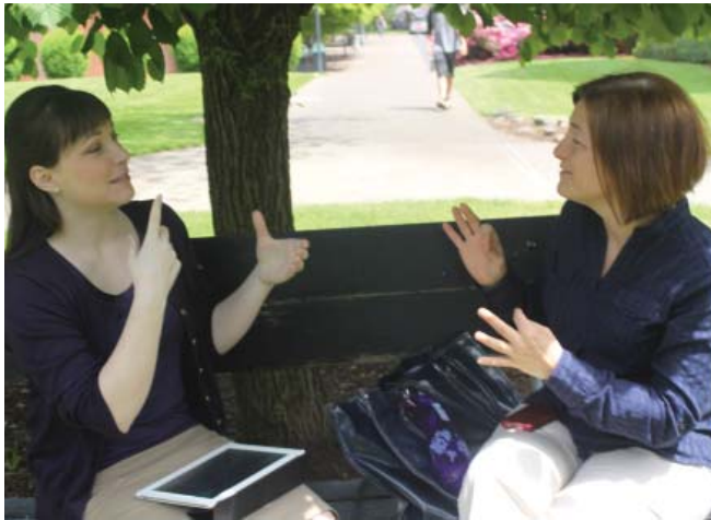
WOU's Master of Arts in Interpreting Studies has won the 2013 University Professional & Continuing Education Association (UPCEA) West Region Outstanding Credit Program Award

Western Oregon University's Master of Arts in Interpreting Studies (MAIS) won the 2013 University Professional & Continuing Education Association (UPCEA) West Region Outstanding Credit Program Award, which recognizes outstanding professional and continuing education programs allowing students to earn academic credit. The award was presented at the UPCEA West Region Conference in Tucson, Arizona.