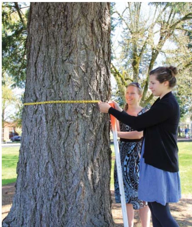
Students and faculty team up to study trees in Monmouth to aid in city planning and the creation of green spaces.