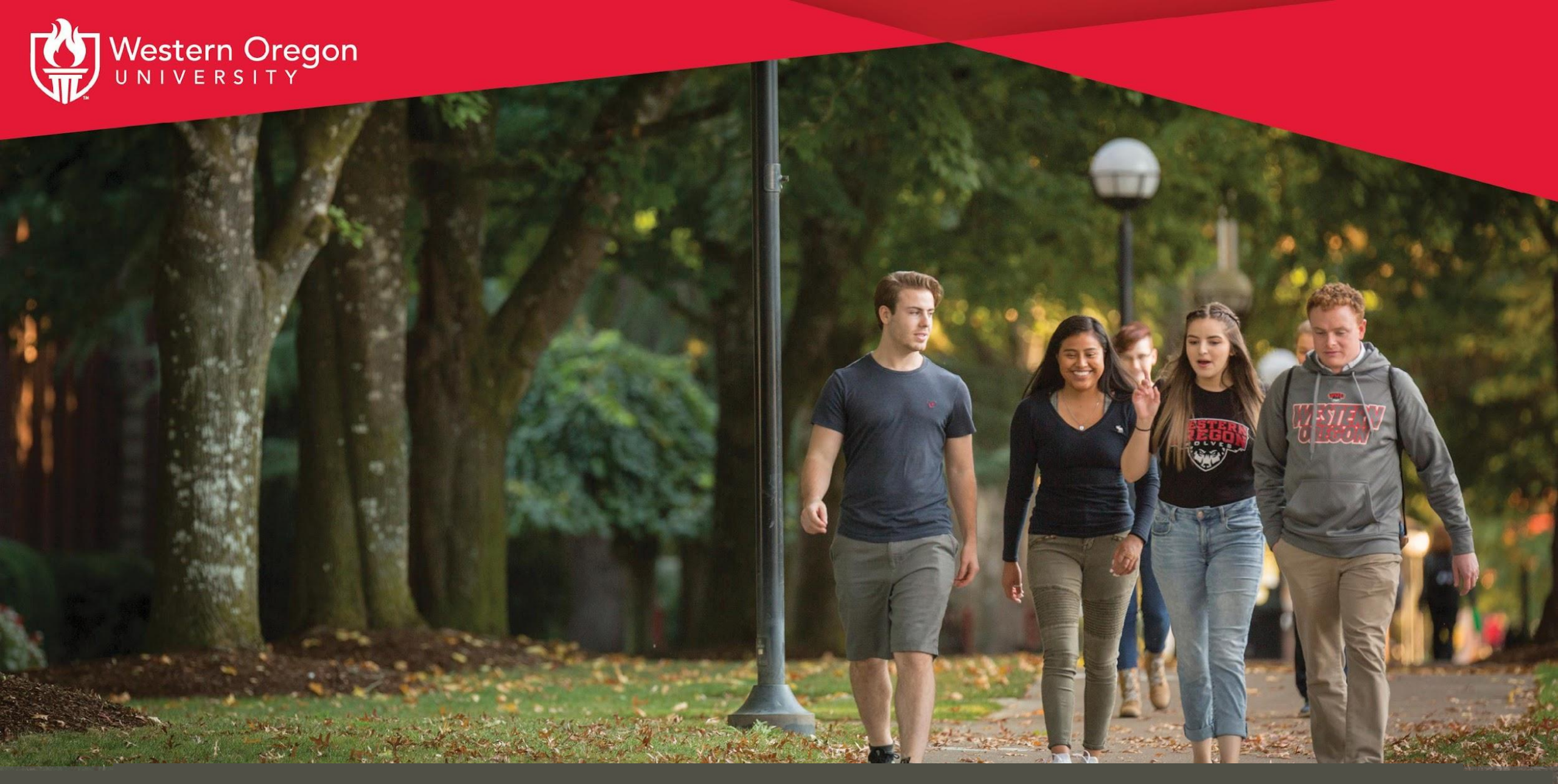
WOLFIE Chatbot - One year later